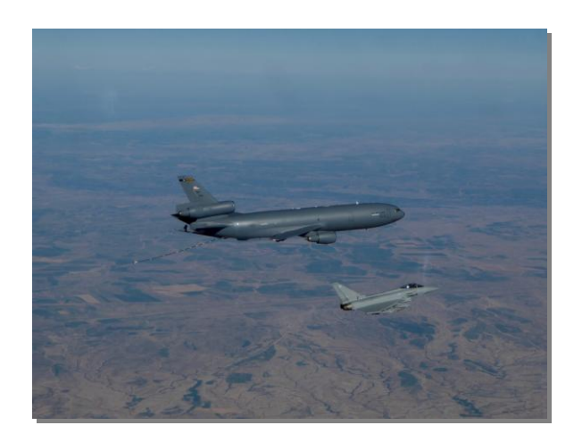
AAR with a KC10